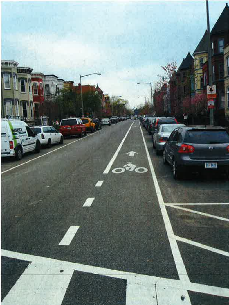
W Street, NW Bicycle Lane