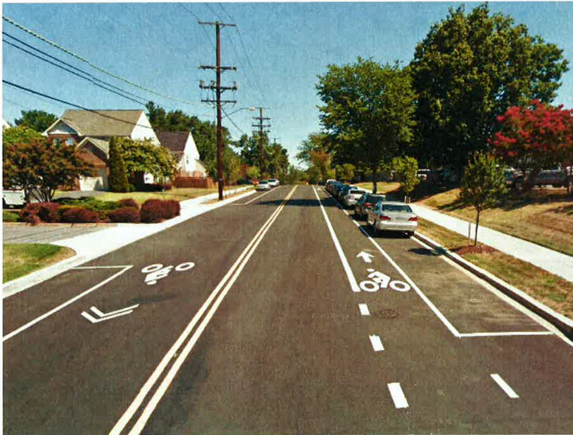
18th Street, NE